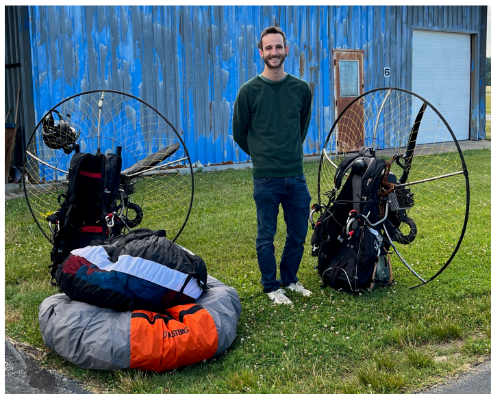
A First! Paragliders flew in to our breakfast on June 24.