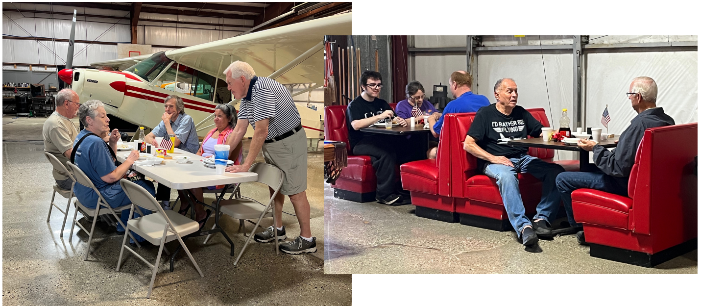
Members and guests enjoying breakfast and sharing aviation stories.

Our address is: EAA Vintage Chapter 37 2616 County Road 60, Box 9 Auburn, IN 46706